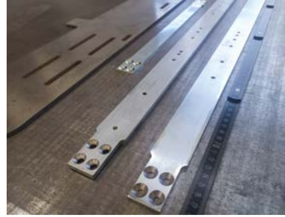
The longitudinal and transverse struts as well as the base panels of the frame are leveled before assembly, in order to satisfy the high requirements for levelness and precision, and to eliminate tension in the material.

In order to protect the material to be leveled from contamination, the machines are thoroughly cleaned at regular intervals in the KOHLER leveling center. A major advantage here is the Peak Performer’s advanced