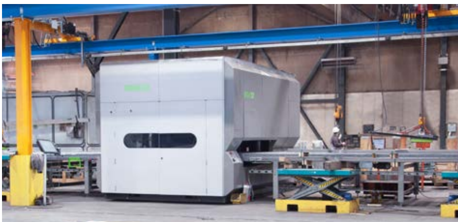
Around 400 tons of material are leveled at DEUMU every month on average.

With the Peak Performer range, which has enjoyed many years of success, KOHLER offers high-performance and energy-efficient part leveling machines for numerous applications. These machines are used in particular for leveling parts, blanks, and whole sheet metal plates.