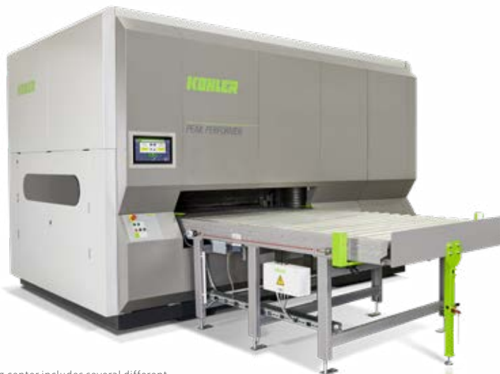
KOHLER’s leveling center includes several different variants of the state-of-the-art Peak Performer part leveling machine.

The skeleton project manager is fully satisfied with his new technology partner and the results of the contract leveling. “The struts and base panels of our sleds exhibit a very high degree of precision after leveling, even with long lengths and different material grades,” he sums up. “We can use this to simplify the further assembly process because we are required to perform significantly less manual rework.” Leveling also almost entirely eliminates tension in the material. “Our athletes therefore benefit from very clear advantages in competition because they can use the best possible equipment,” Zerbe is delighted to report, adding: “We are already carrying out leveling tests with KOHLER in the luge area too, so there will be additional collaboration here in the near future.”