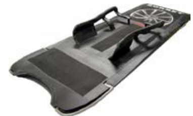
The skeleton sleds are manufactured from stainless and high-strength steels with a thickness of between three and eight millimeters. They consist of cowling, a frame, and two runners.