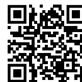
Video: Perfectly leveled perforated sheets