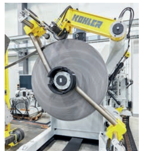
Coil loading chair and decoiler can be delivered with a capacity of up to 35 tons.

Lines with conventional drive can also be delivered with leveling rollers having a diameter from 18 – 30 mm. The product portfolio encompasses strip leveling lines in long and short version for strip widths from 35 to 2,000 mm and thickness from 0,1 to 12 mm, upgradeable with camber leveling devices. ■