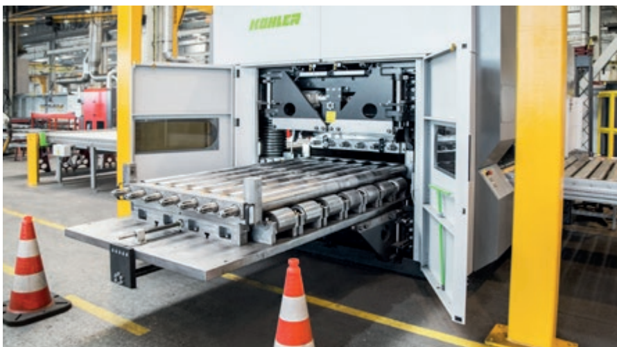
The Peak Performer’s advanced cleaning system enables the leveling rollers and supporting rollers to be fully moved out of the machine, by means of electric motor, for quick, easy cleaning. .