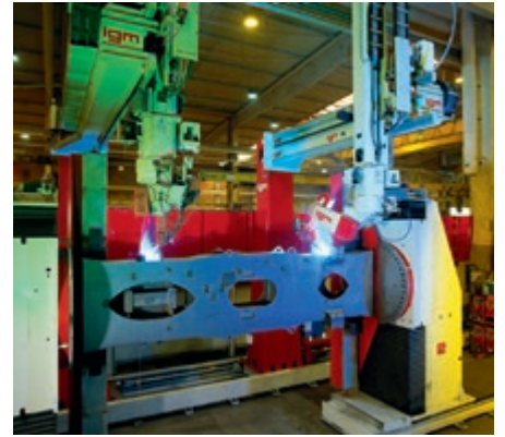
One of the production processes after leveling is oxy-acetylene robot welding. Lev-eled parts ensure a constant weld gap and mean that fixtures can be simplified as leveled material only exhibits stresses on a small scale during welding.

shafts. In practice, this means less electricity consumption compared to conventional part leveling machines which have servo-hydraulic leveling gap control and cardan shafts. In addition to being energy efficient, it also increases the direct input of power into the leveling rollers. This in turn increases the material cross section that can be leveled, and considerably enlarges the working range, particularly in the case of wider sheets. What is more, the directly driven rollers reduce slip on the material, ensuring gentler machining of the surface. The steel workers in Stefan Richter and Torben Handeck's team level steel blanks (S355)2+N and S355MC) with thicknesses ranging from 8mm to 40mm with ease.