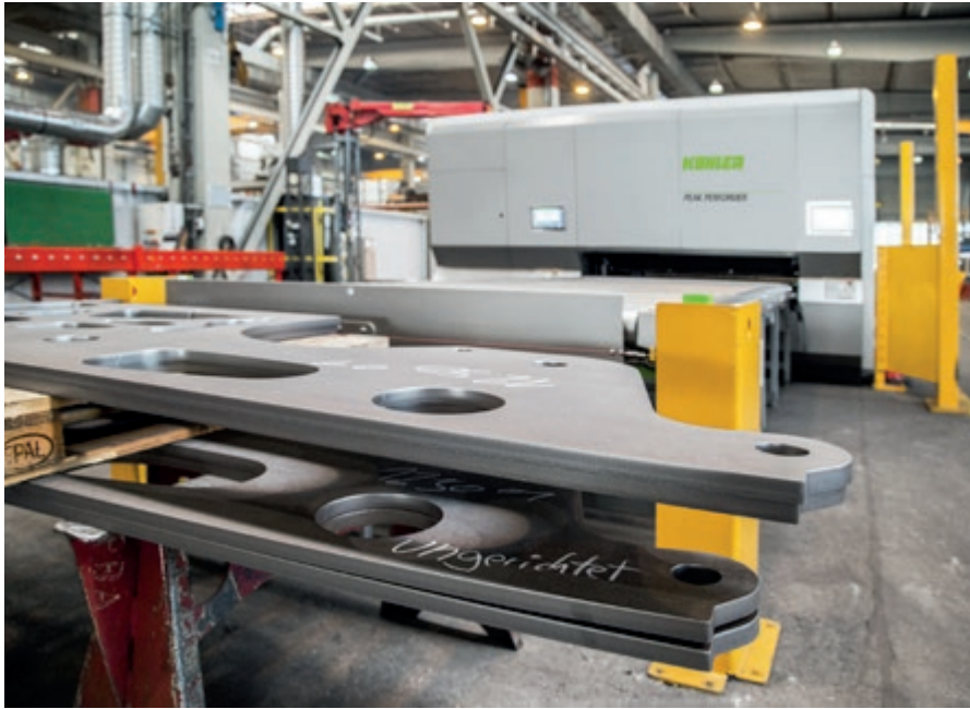
Precisely leveled and stress-free steel plays an important role when it comes to en-suring the high quality of Liebherr products.